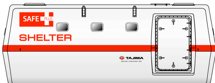
Side View - Door Side